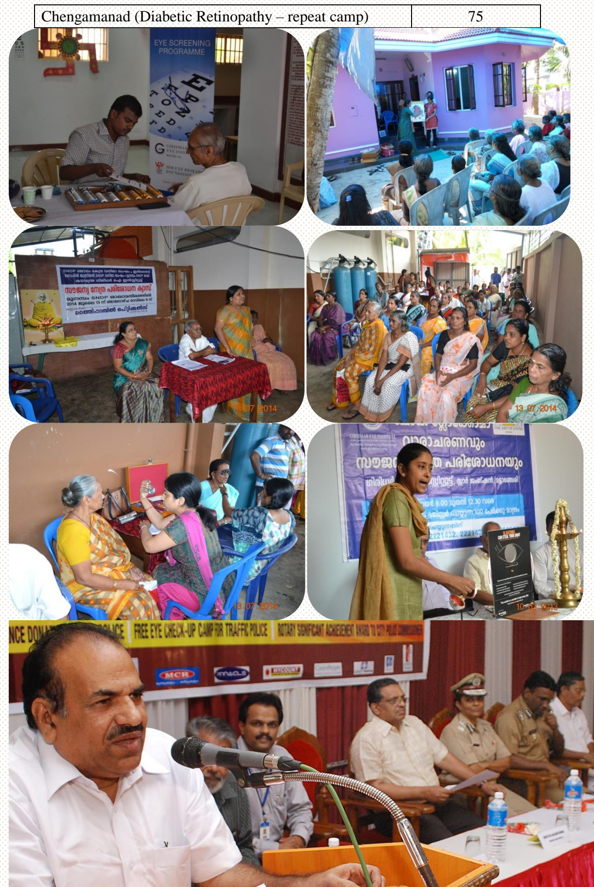
Camp Organized for Cochin Traffic Police organized through Rotary Club